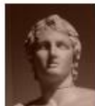
Alexander the Great A King and General

Ancient Greece was packed with famous mathematicians, philosophers and other historical figures.